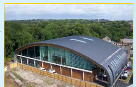
International swimming pool complemented by its woodland setting

The enhancement of discrete, quiet areas for wildlife will be facilitated by minimising access and disturbance in these places.