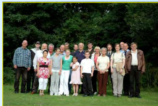
Friends of Thoroughsale and Hazel Wood

Hazel & Thoroughsale Woods are historically part of the Rockingham Forest and are today one of the most notable areas of woodland in Corby. Occupying 73 hectares in central Corby, these woods are a valuable green space for the people of Corby and for wildlife. However, there is considerable scope to improve their condition, attractiveness and accessibility.