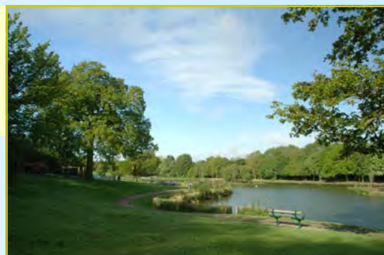
Corby Boating Lake

The Management Plan will deliver a multitude of improvements and benefits for the people of Corby and its wildlife. The wide ranging and integrated activities envisaged will ensure that these improvements and benefits are long term and sustainable.